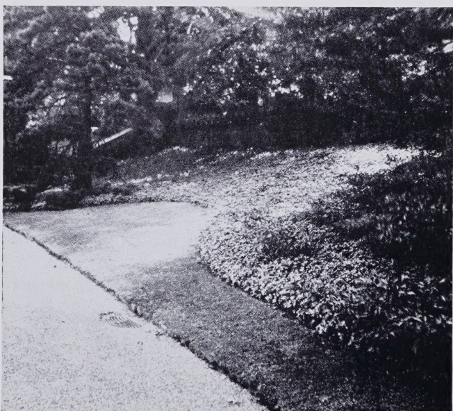
PACHYSANDRA may be used successfully upon steep banks and terraces